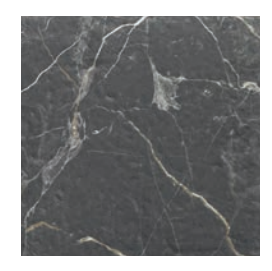
Hermitage Dark 20x20cm