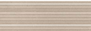
Light Beige Struktura Lines Decor