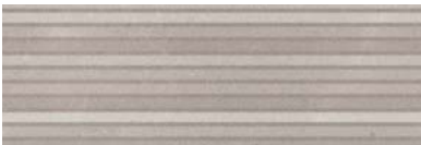
Light Grey Struktura Lines Decor

Glazed Porcelain 59.8x59.8cm Annexe G - Bla