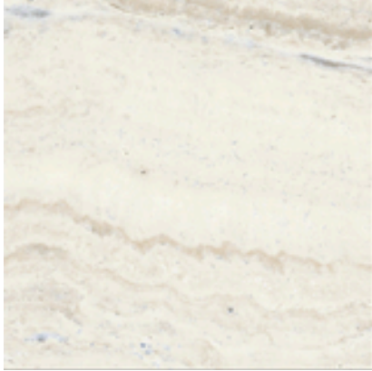
Sloane Travertine 25x25cm