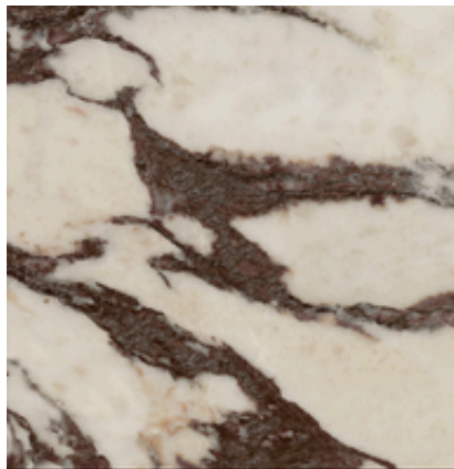
Sloane Viola 25x25cm