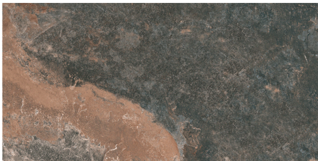
Cove Anthracite 30x60cm