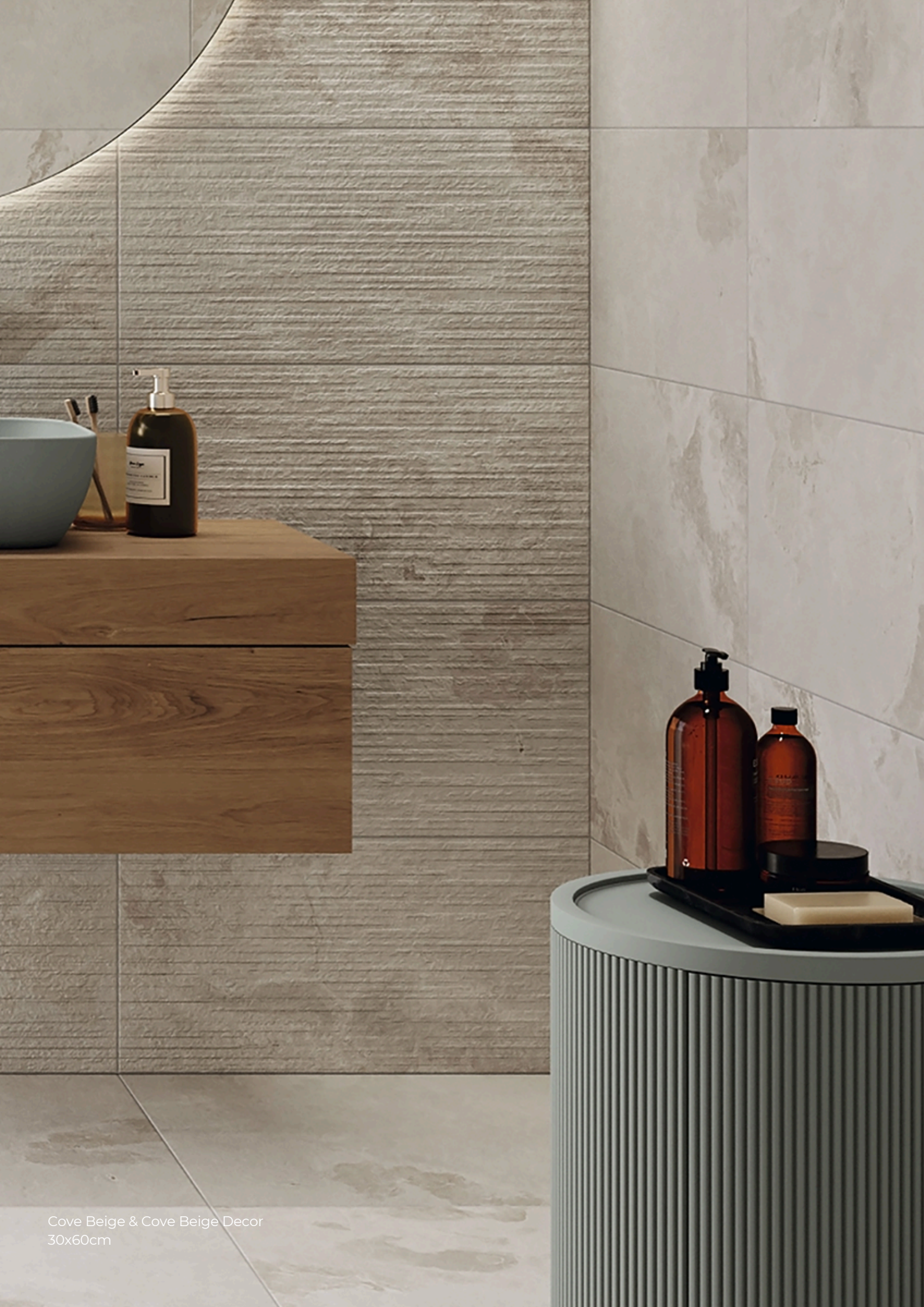
Cove Beige & Cove Beige Decor 30x60cm