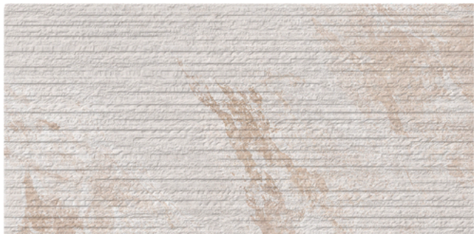
Cove Beige Decor 30x60cm