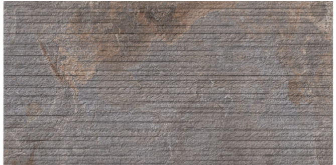
Cove Grey Decor 30x60cm