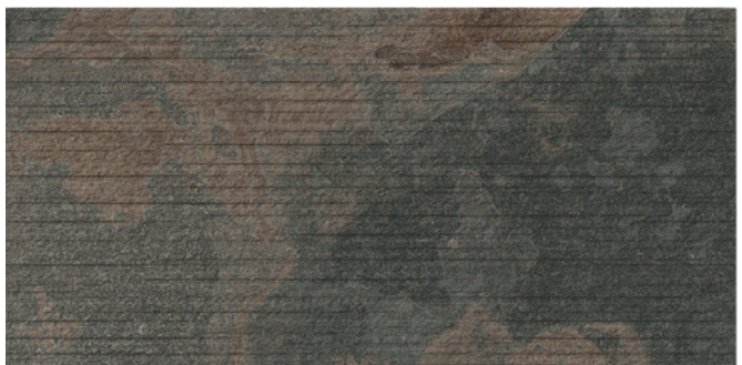
Cove Anthracite Decor 30x60cm