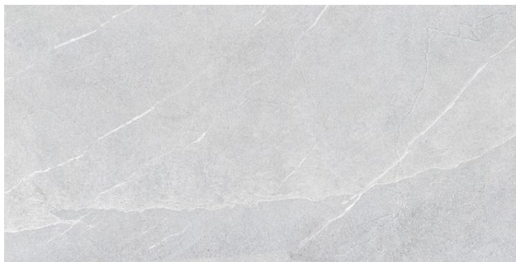
Pietra Di Lavagna Perla 60x120cm