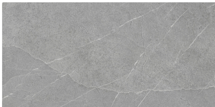
Pietra Di Lavagna Argento 60x120cm