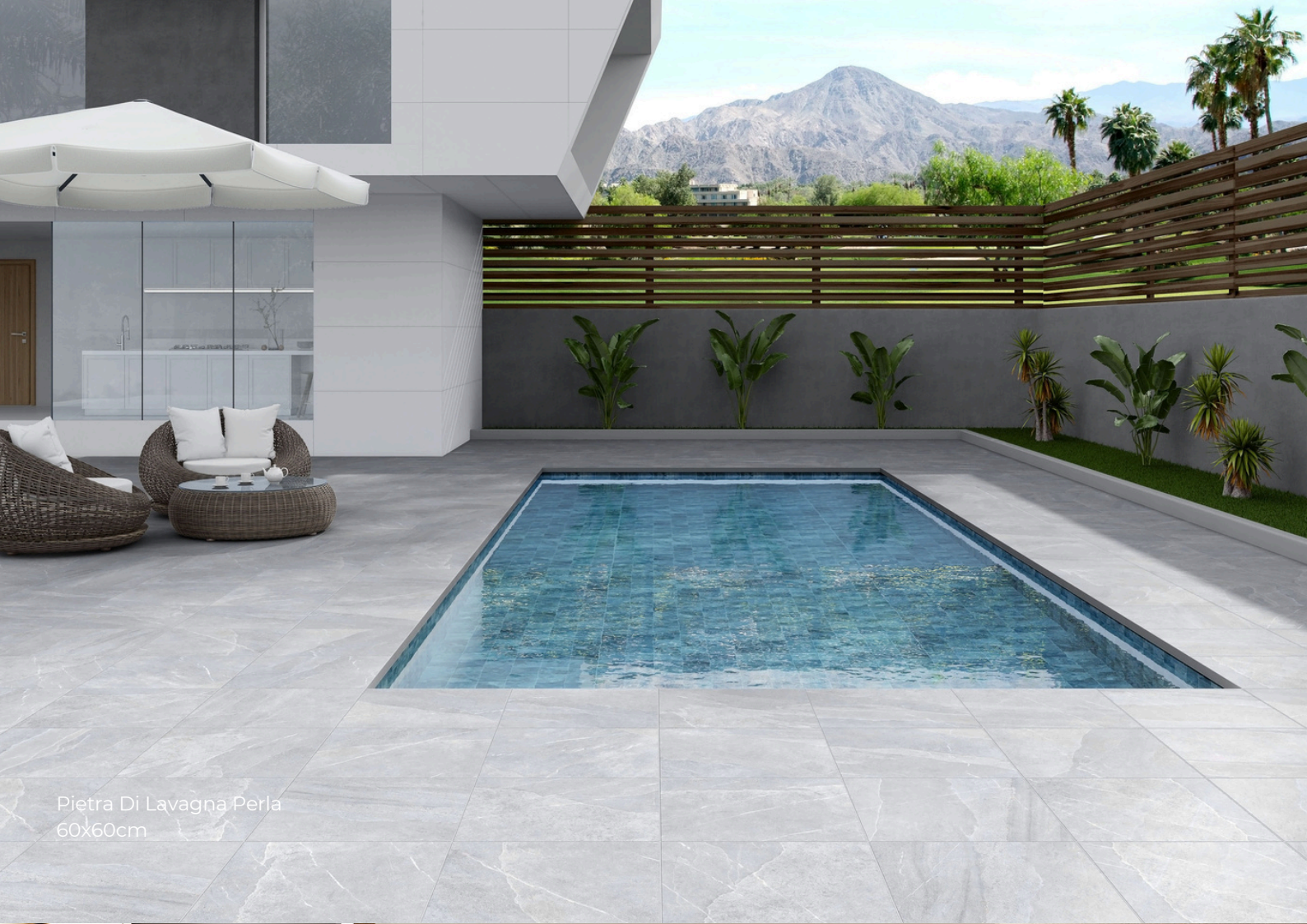
Pietra Di Lavagna Perla 60x60cm