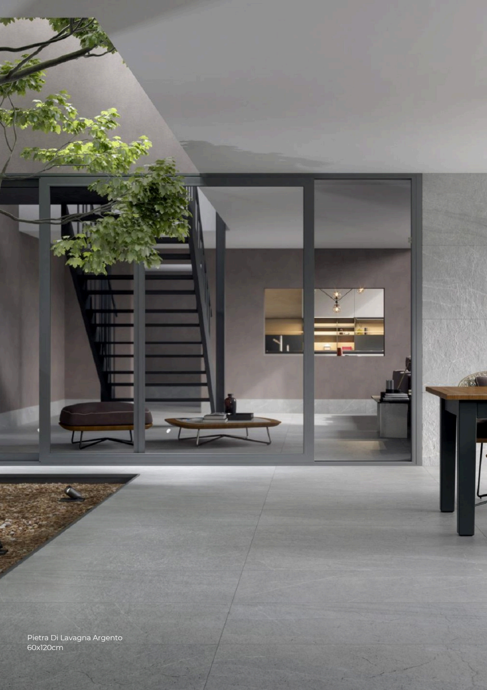
Pietra Di Lavagna Argento 60x120cm