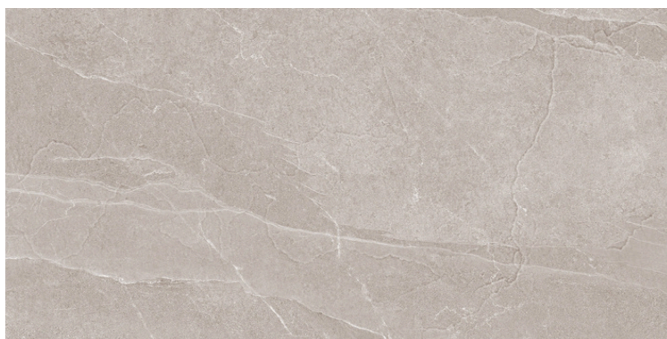
Pietra Di Lavagna Sabbia 60x120cm