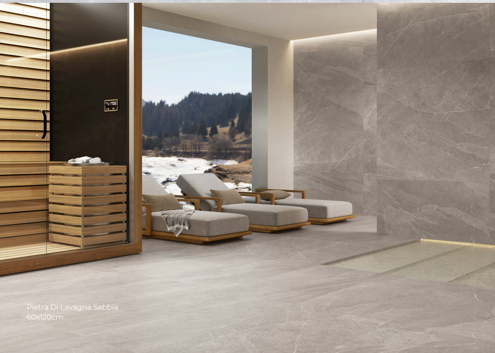
Pietra Di Lavagna Sabbia 60x120cm