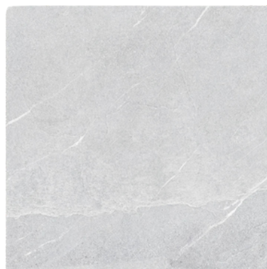
Pietra Di Lavagna Perla 60x60cm